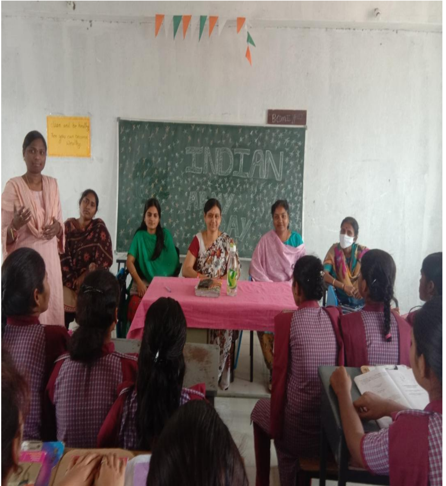
Indian Army Day