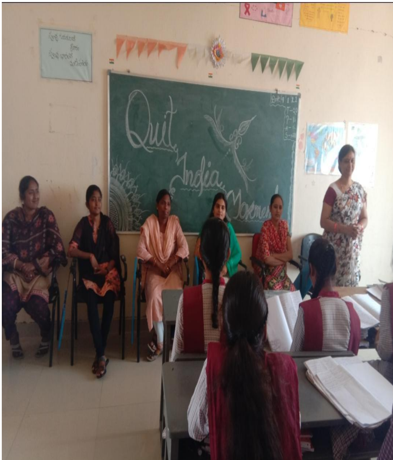
Quit India Movement