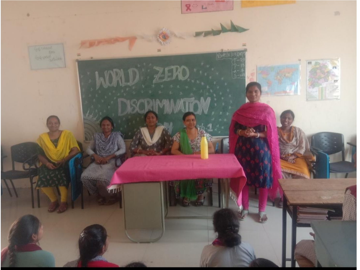
World Zero Discrimination Day