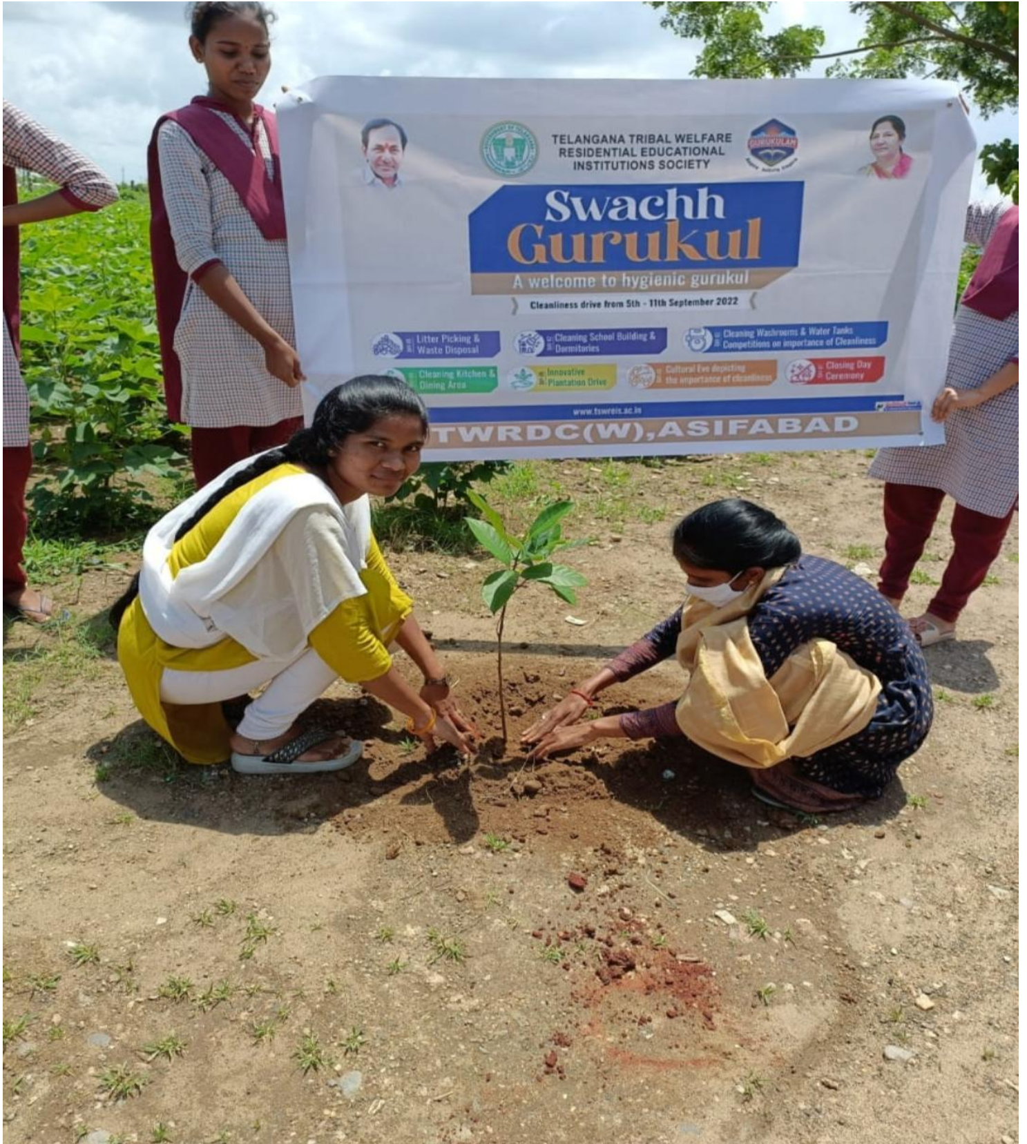
Swaccha gurukulam program