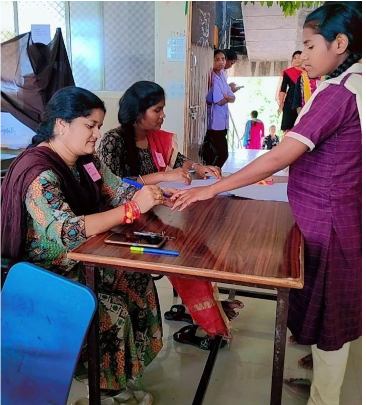
MOCK STUDENTS ELECTIONS