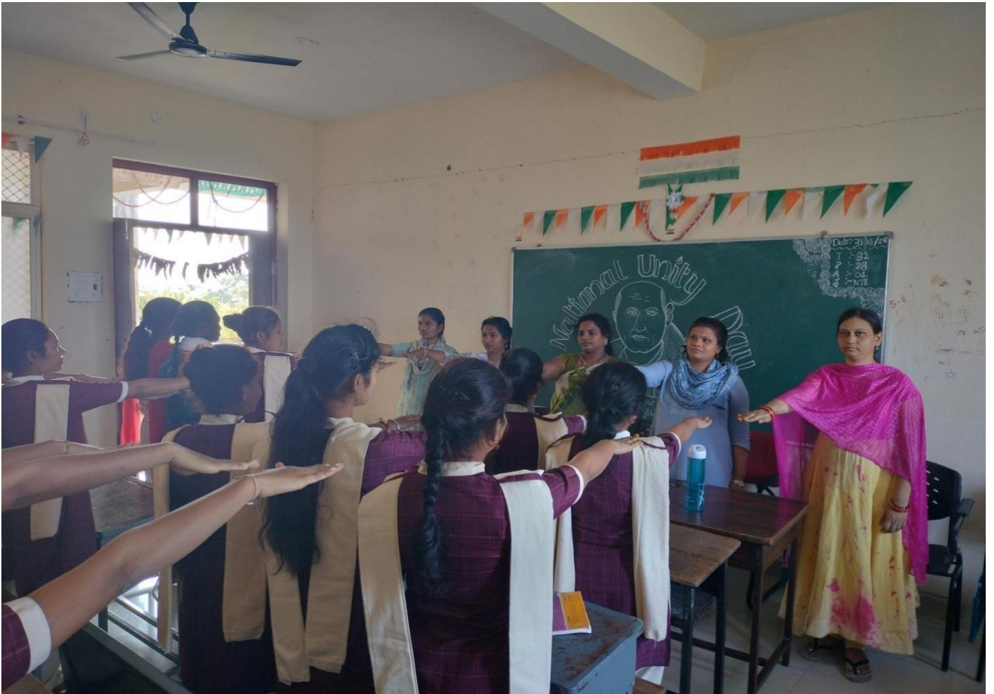
NATIONAL UNITY DAY CELEBRATIONS