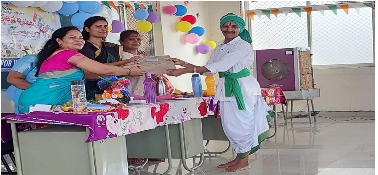
FASHION DRESS COMPETITION