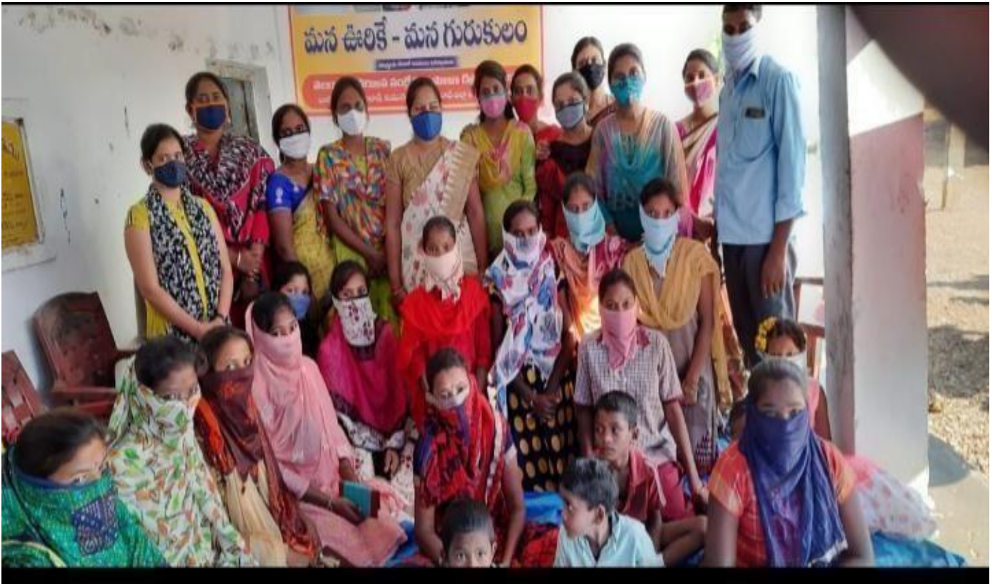
MANA VURIKI MANA GURUKULAM