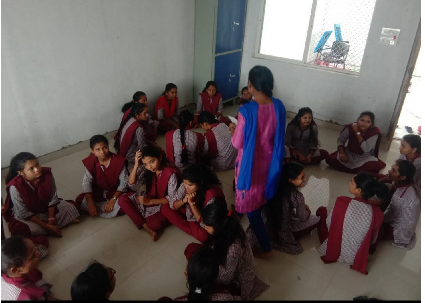
Quiz Competition History