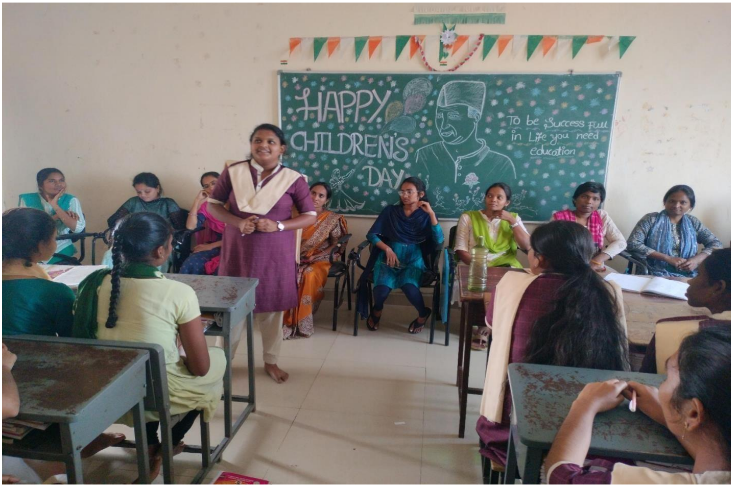
CHILDRENS DAY CELEBRATIONS