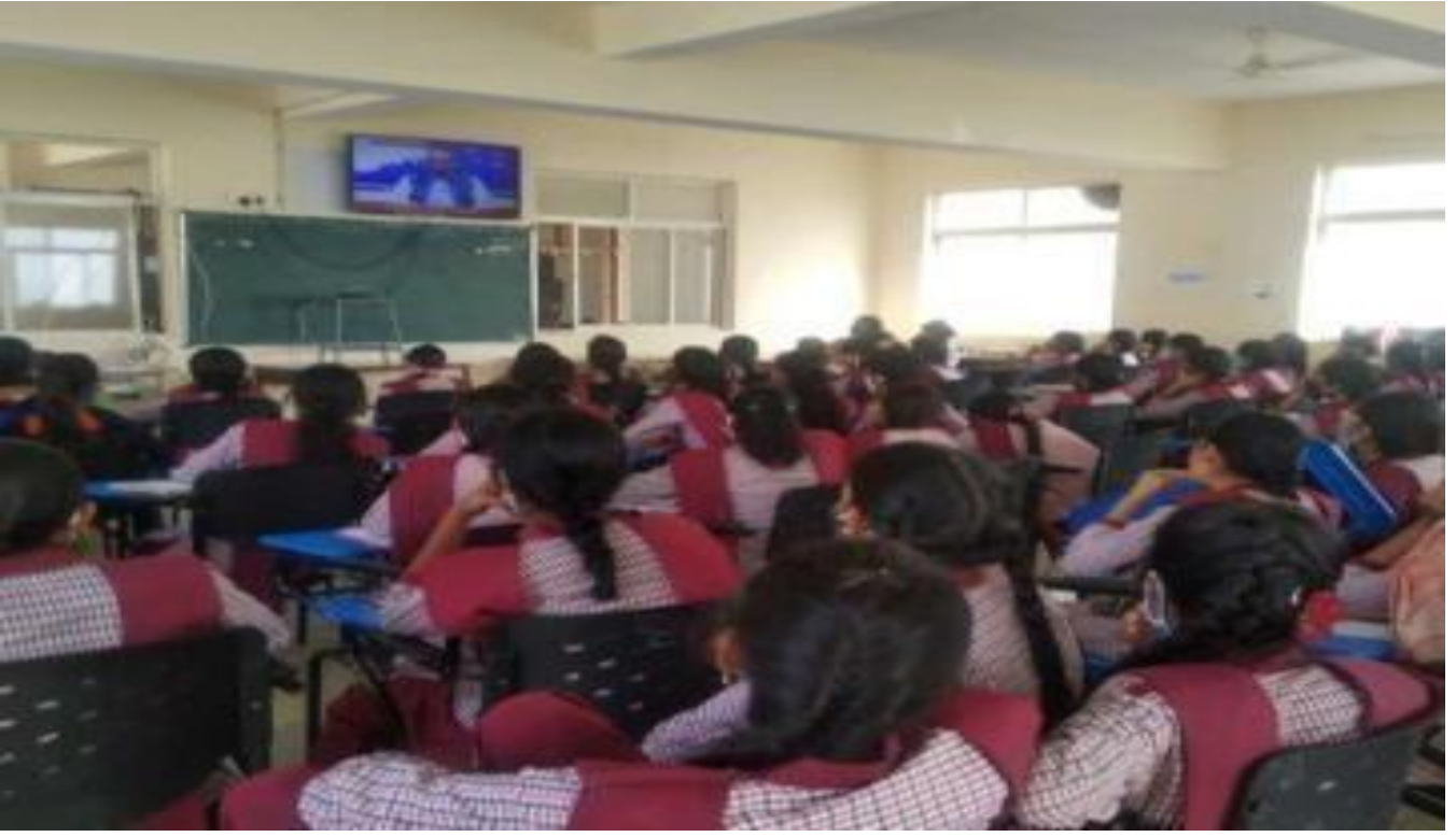
MANA TV PROGARGAM AT COLLEGE