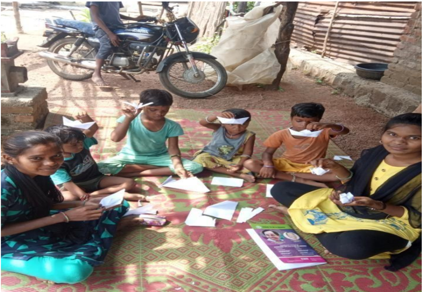
VLC PROGRAM ON CARONA TIME