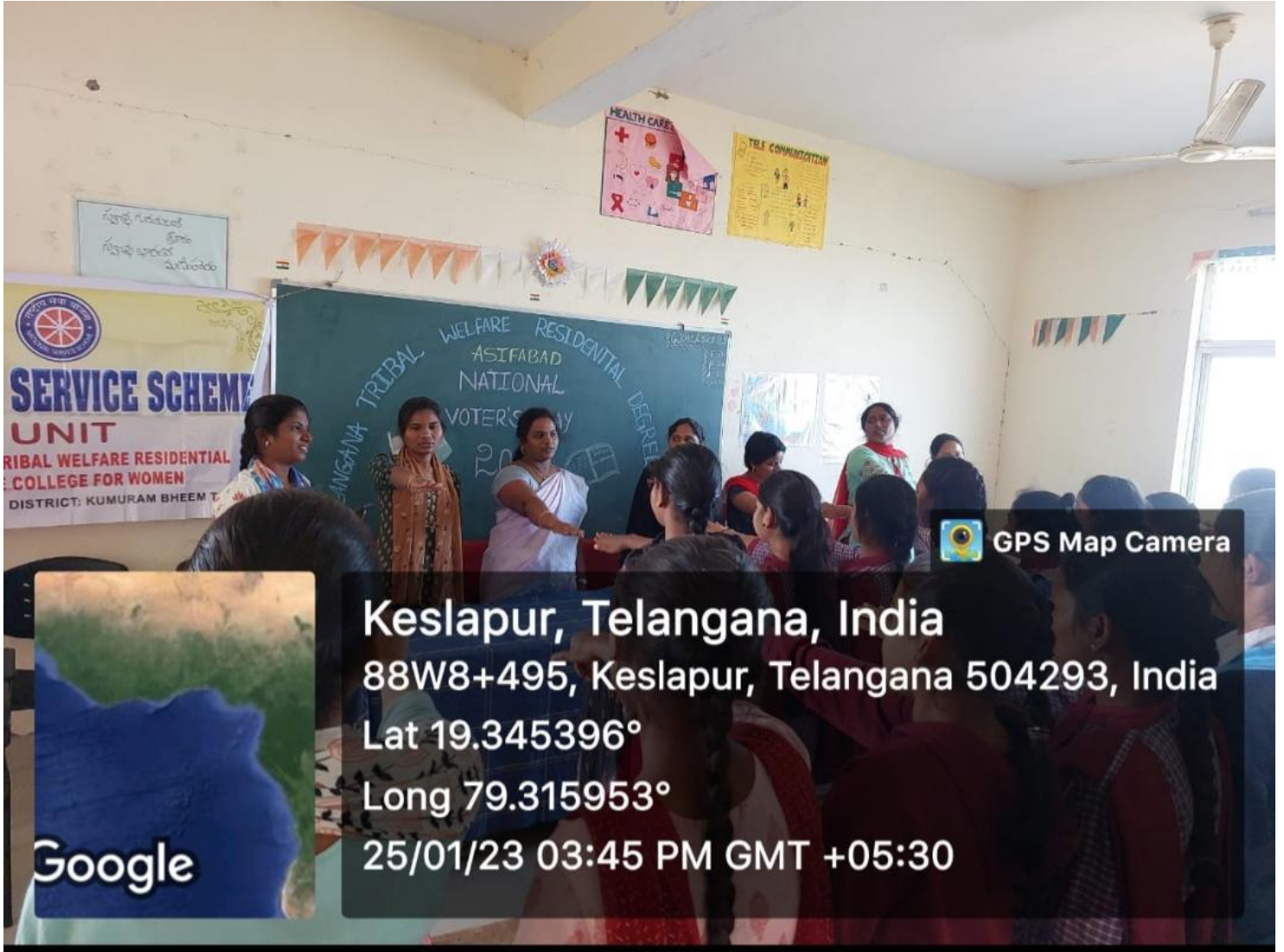
National Voters Day