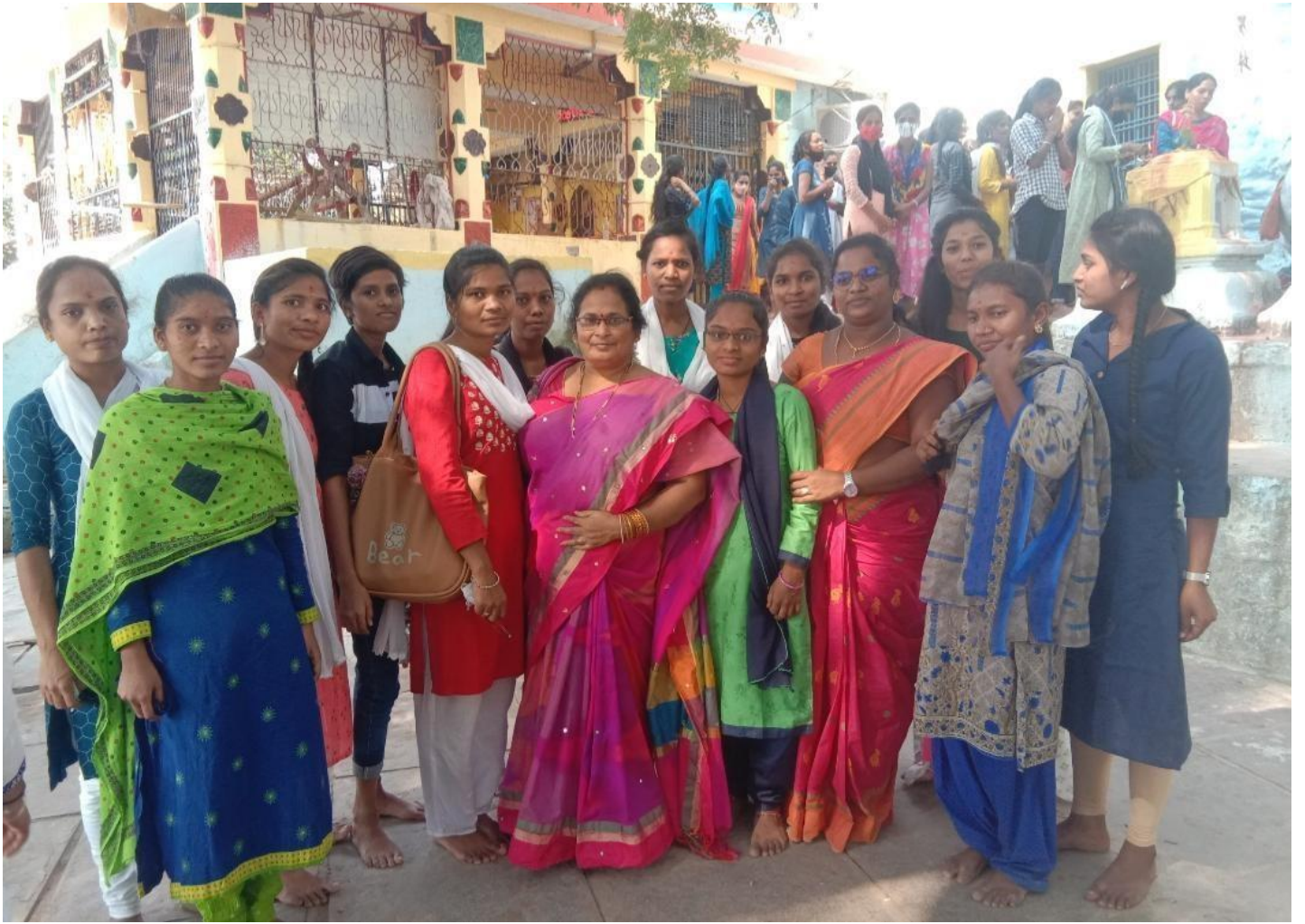
FIELD TRIP AT GANGAPUR